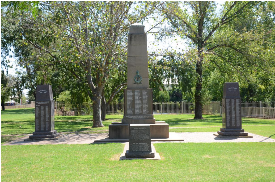
Temora & District War Memorial